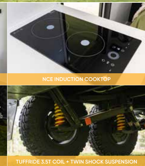
NICE INDUCTION COOKTOP

$409,468 FIRST PRIZE PACKAGE | BUY TICKETS: CARSFORCANCER.COM.AU OR 1800 067 066 | FUELLING CANCER RESEARCH FOR OVER 20 YEARS