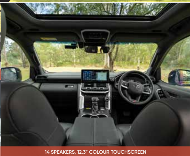
14 SPEAKERS, 12.3" COLOUR TOUCHSCREEN