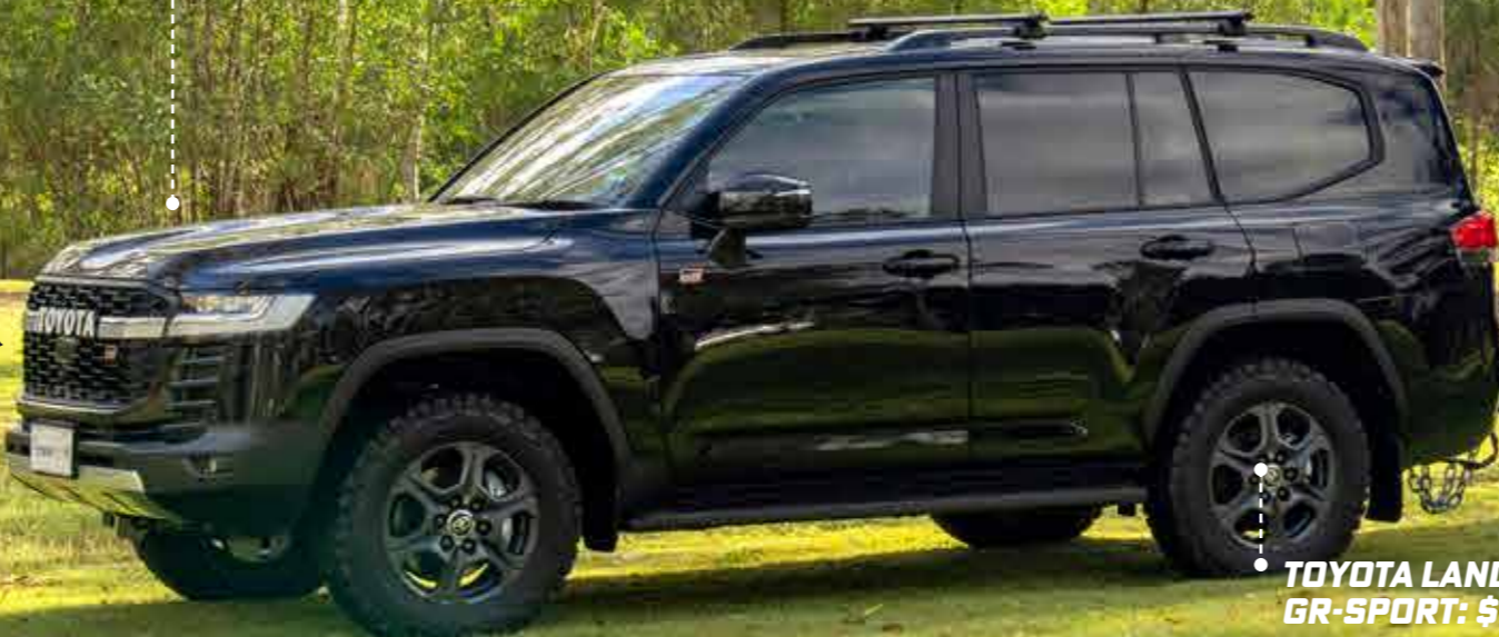
TOYOTA LANDCRUISER GR-SPORT: $153,780