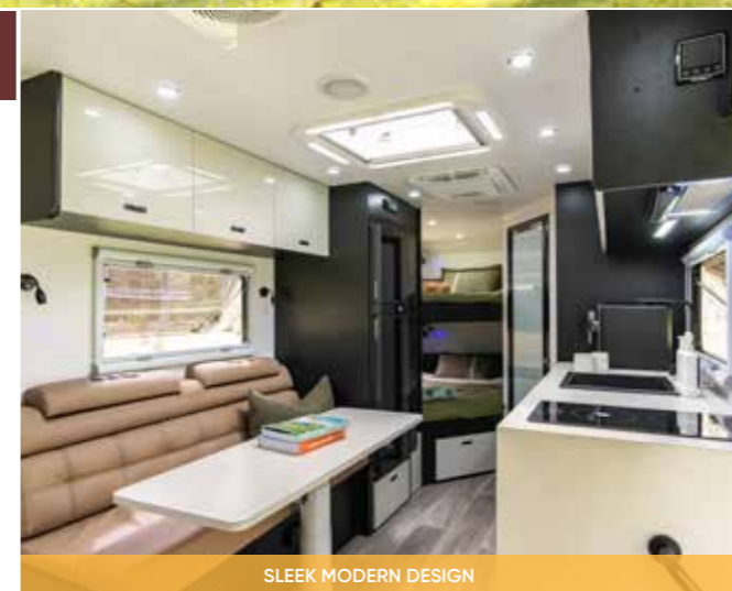
SLEEK MODERN DESIGN

YOUR GREAT ESCAPE AWAITS... BUY YOUR TICKETS TODAY!