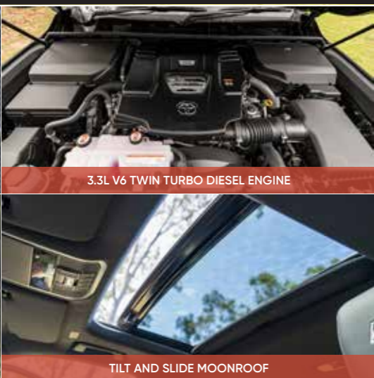
3.3L V6 TWIN TURBO DIESEL ENGINE