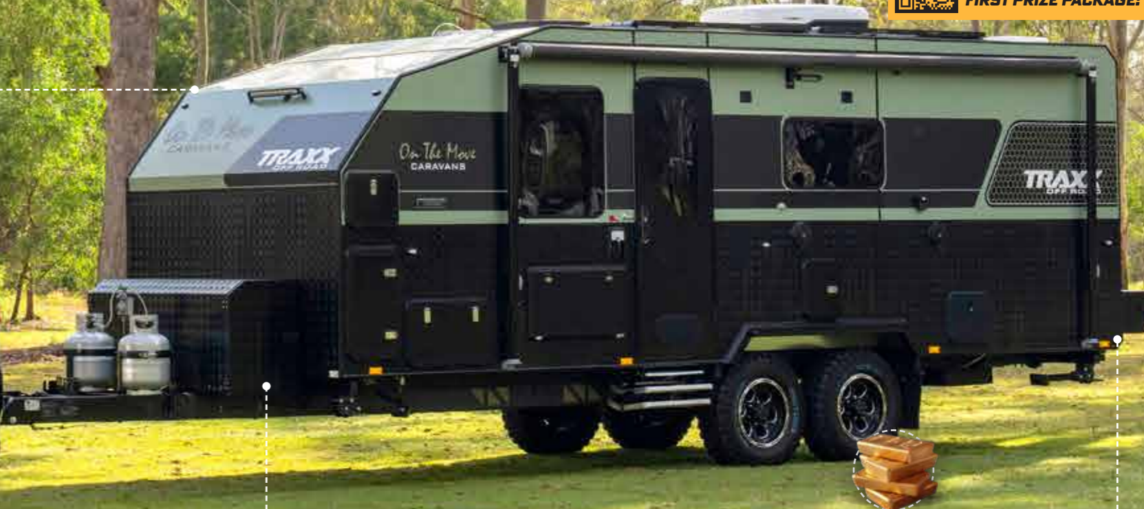
ON THE MOVE TRAXX OFF ROAD CARAVAN INC. STYLING: $135,688