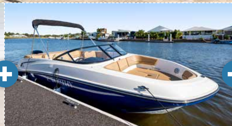
BAYLINER VR5 OUTBOARD