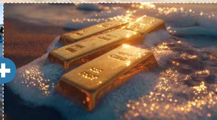
$500K GOLD BULLION