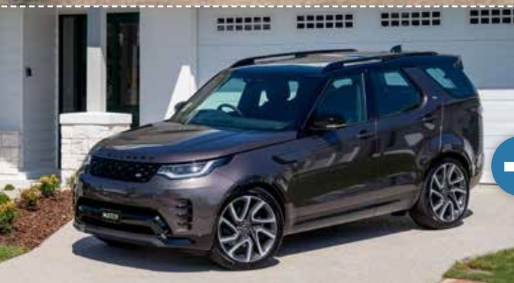
LAND ROVER DISCOVERY DYNAMIC HSE