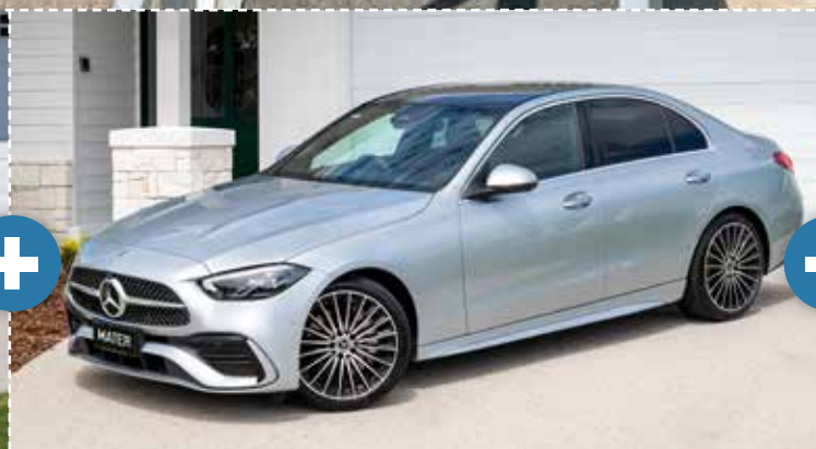
MERCEDES C 300 SEDAN