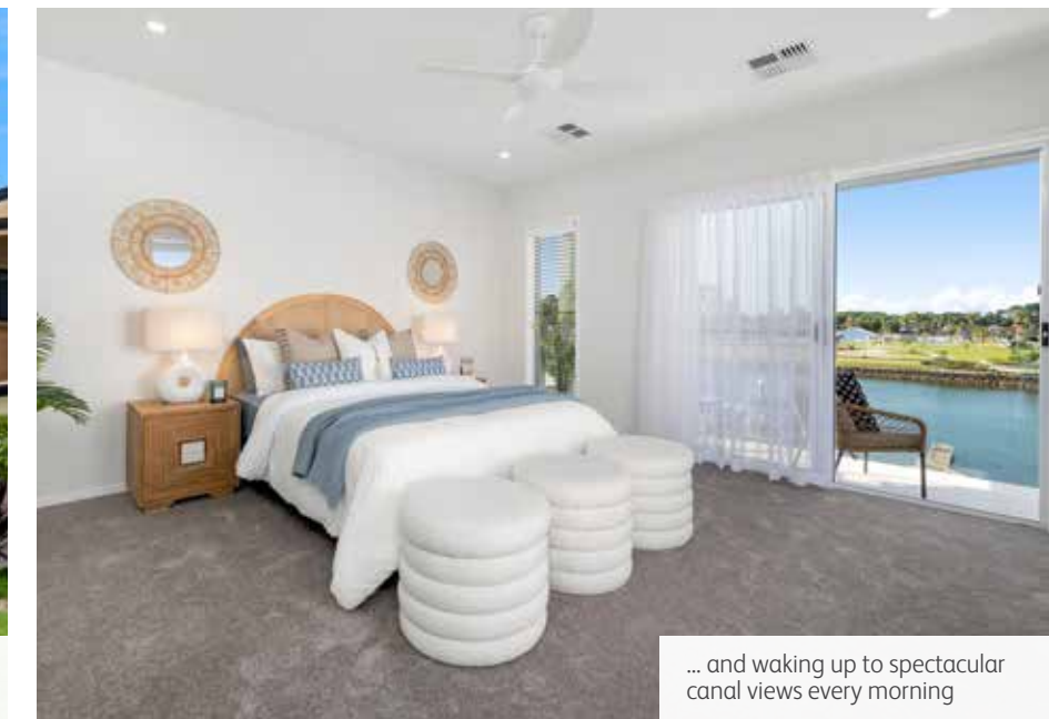
... and waking up to spectacular canal views every morning