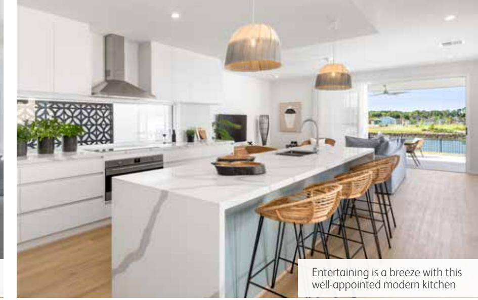
Entertaining is a breeze with this well-appointed modern kitchen