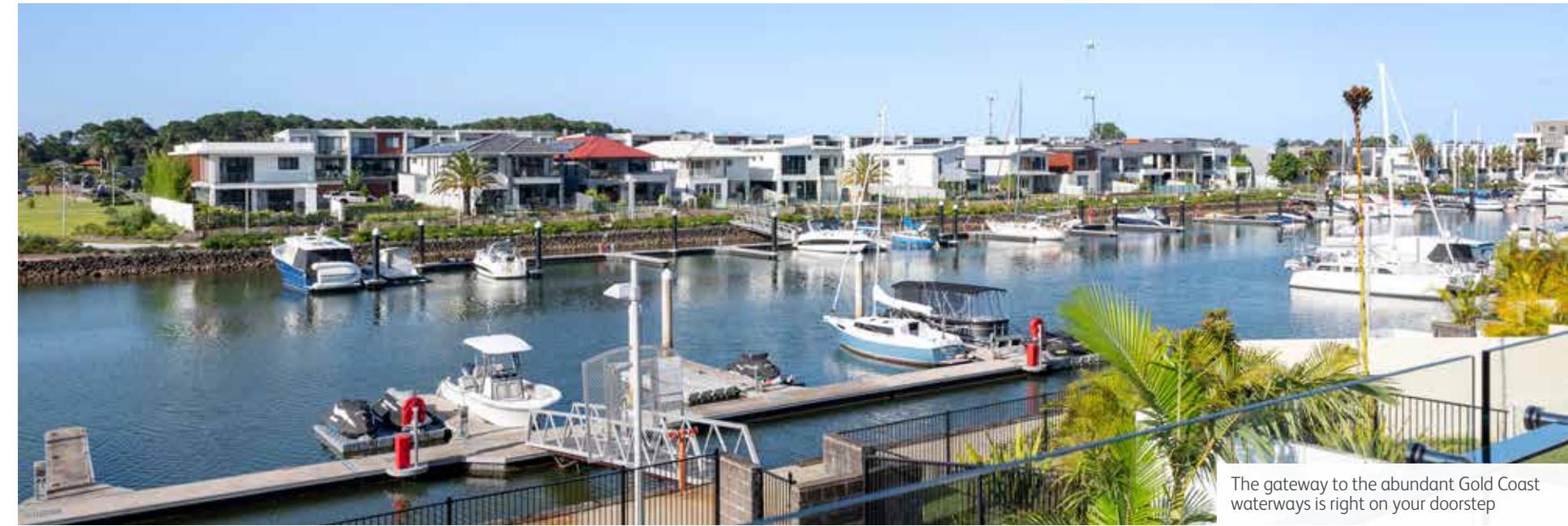
The gateway to the abundant Gold Coast waterways is right on your doorstep