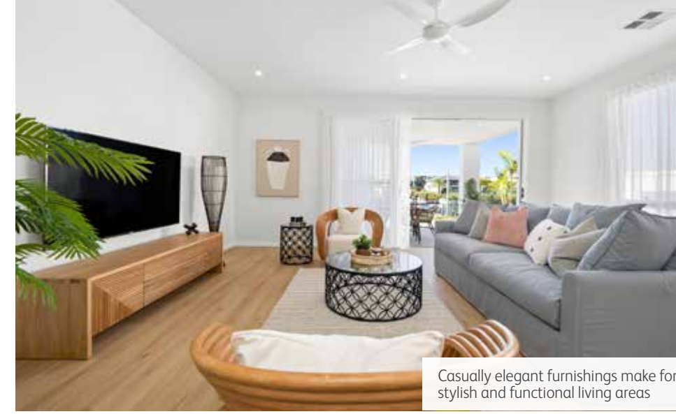
Casually elegant furnishings make for stylish and functional living areas

FIRST PRIZE PACKAGE $2.6 MILLION FIRST PRIZE PACKAGE