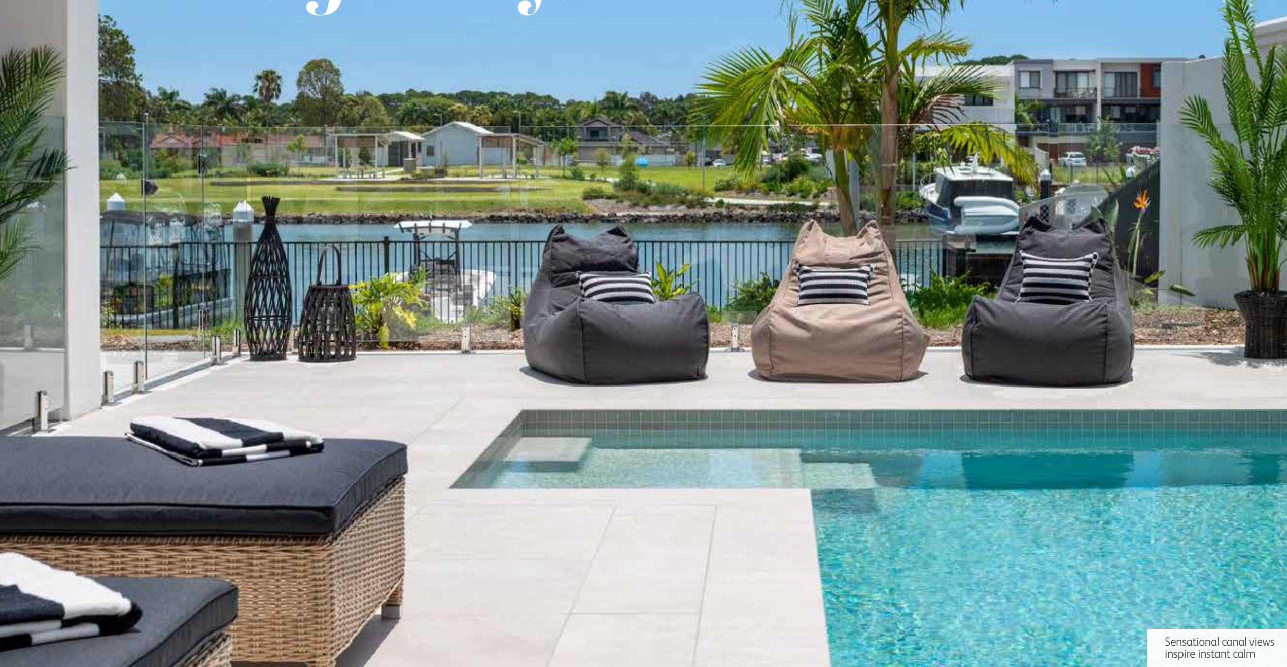
Sensational canal views inspire instant calm