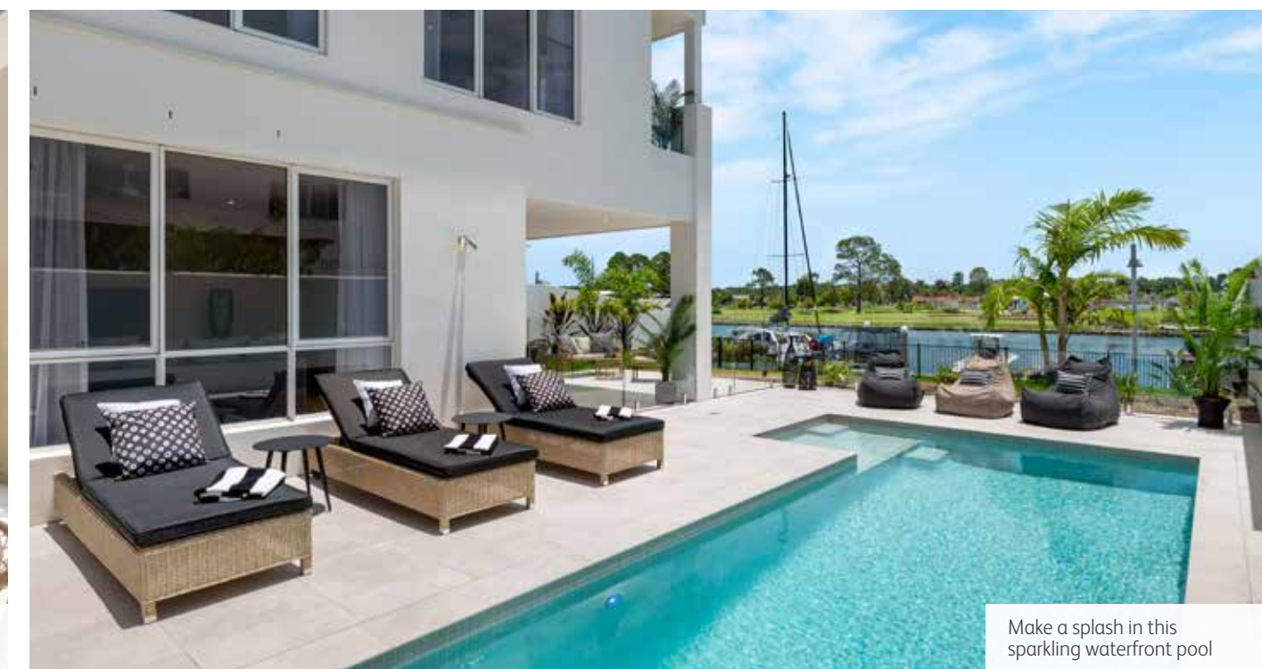
Make a splash in this sparkling waterfront pool