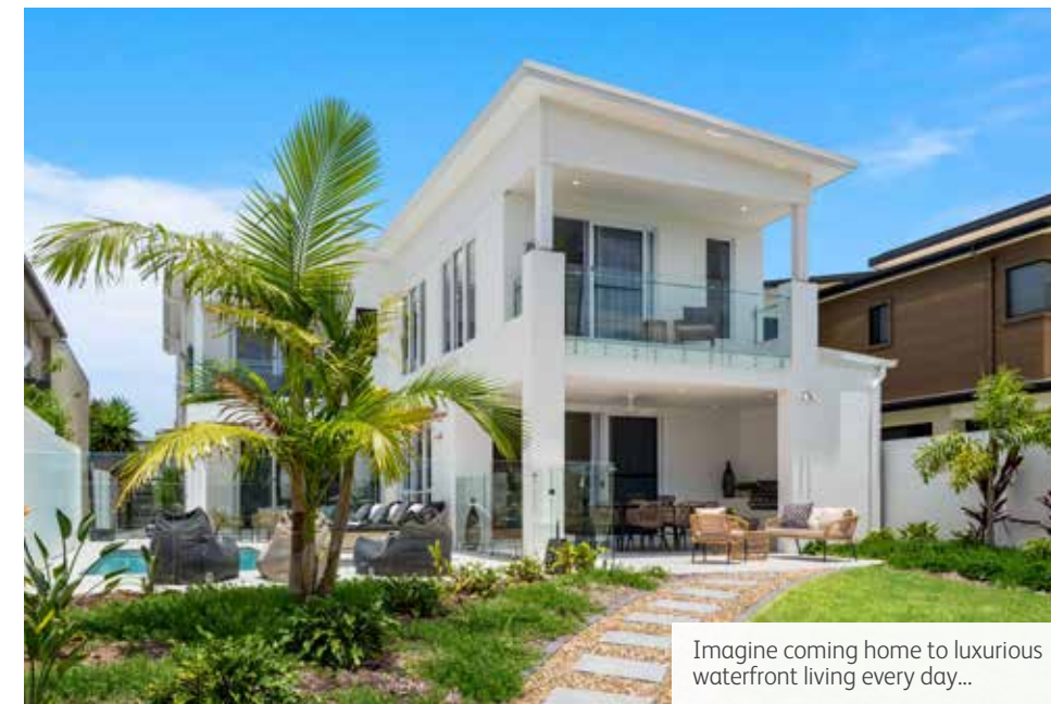
Imagine coming home to luxurious waterfront living every day...